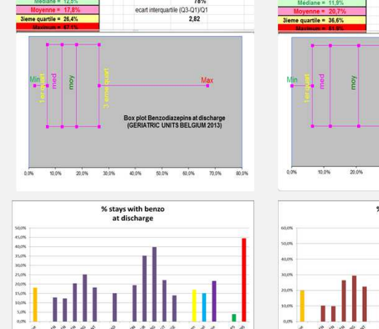
Figure 1) Benzodiazepines 2) Proton Pump Inhibitor